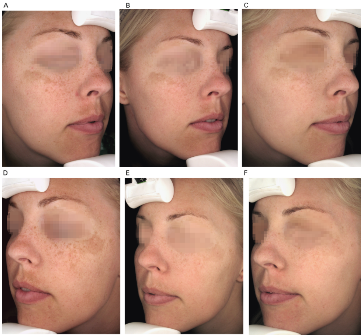
Figure 3. Patient 083: (A)–(C) Inactive cream and IPL; baseline, week 6, and week 10. (D)–(F) TC cream and IPL; baseline, week 6, and week 10.

turnover and may have caused mild depigmenting in the treated areas. 29 Furthermore, when combined with tretinoin and hydroquinone, fluocinolone acetonide 0.01% in TC cream may have suppressed the biological functions of melanocytes, which in turn decreased melanin production. 29