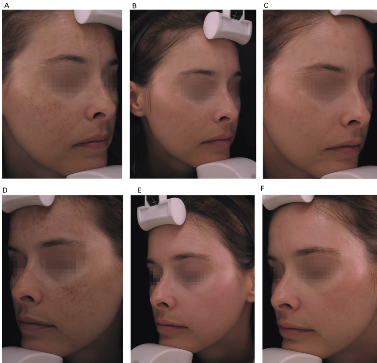
Figure 5. Patient 093: (A)–(C) Inactive cream and IPL; baseline, week 6, and week 10. (D)–(F) TC cream and IPL; baseline, week 6, and week 10.

Another study of 17 Taiwanese women with mixed melasma treated with IPL and hydroquinone reported an average 40% improvement in relative melanin index. AEs including erythema, pain, microcrust formation, and postinflammatory hyperpigmentation were reported. 37 Finally, a recent study in 38 patients of IPL for melasma reported excellent response in 47% of patients and good response in 29%. 27 No complications were reported.