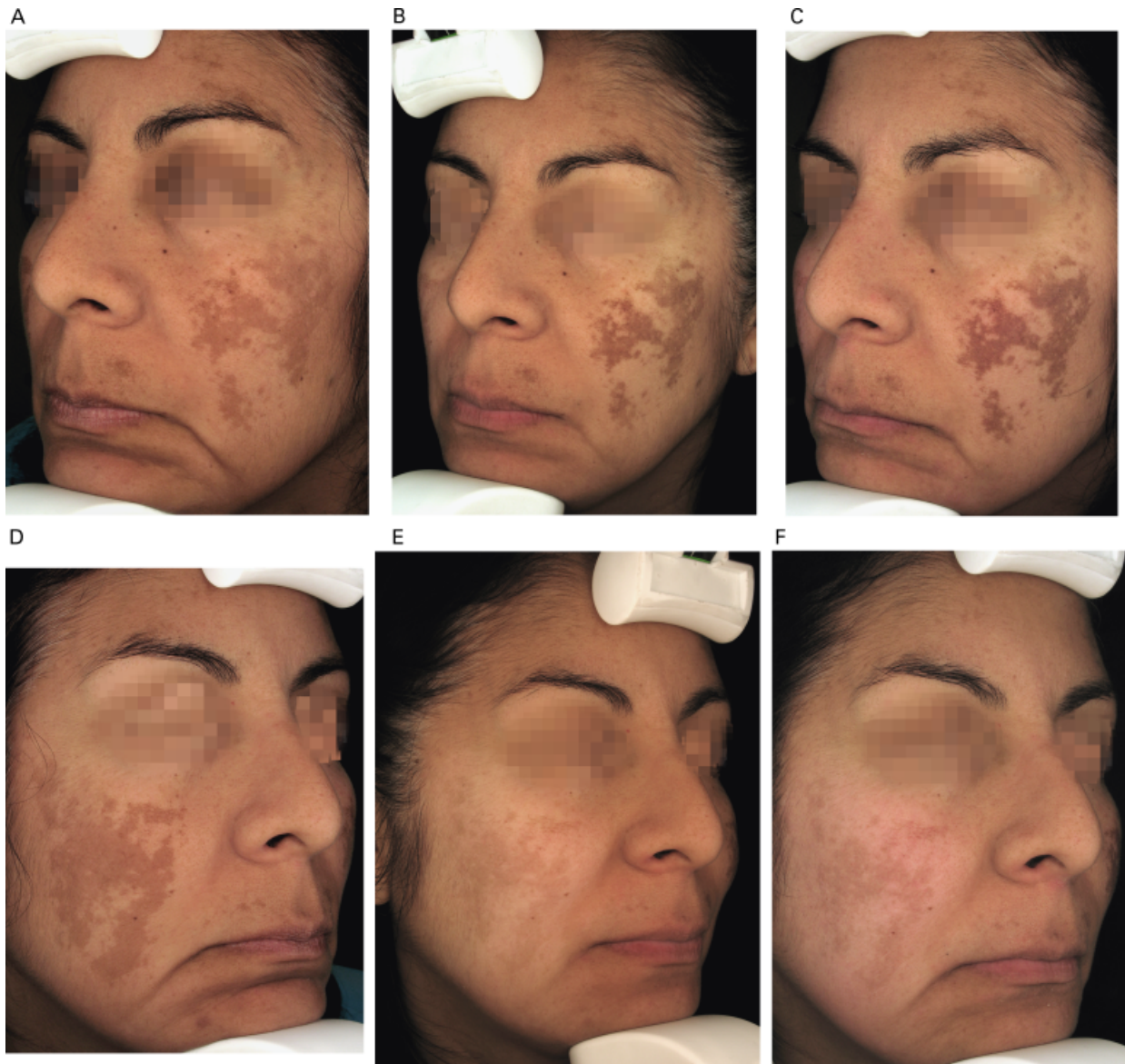
Figure 4. Patient 099: (A)–(C) Inactive cream and IPL; baseline, week 6, and week 10. (D)–(F) TC cream and IPL; baseline, week 6, and week 10.

Therapy that includes the use of TC cream with dermatologic procedures such as chemical peels, microdermabrasion, and laser treatments may optimize the improvements in melasma according to multiple case reports and one small study. 2,12,18,31–33 Corticosteroids are known to have anti-inflammatory properties. 34–36 It is conceivable that the corticosteroid component of TC cream may be partially responsible for the enhanced effects seen when TC cream is used in conjunction with