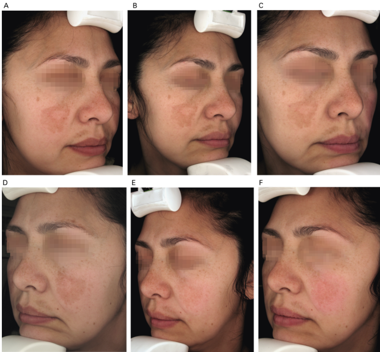
Figure 2. Patient 062: (A)–(C) Inactive cream and IPL; baseline, week 6, and week 10. (D)–(F) TC cream and IPL; baseline, week 6, and week 10.

penetration of hydroquinone. They also reported that the corticosteroid component reduced the irritation associated with the retinoid and that the retinoid normalized skin thinning associated with the corticosteroid. 28,30